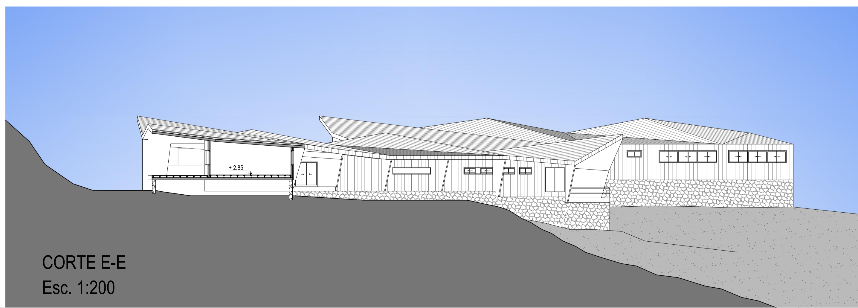
CORTE E-E Esc. 1:200